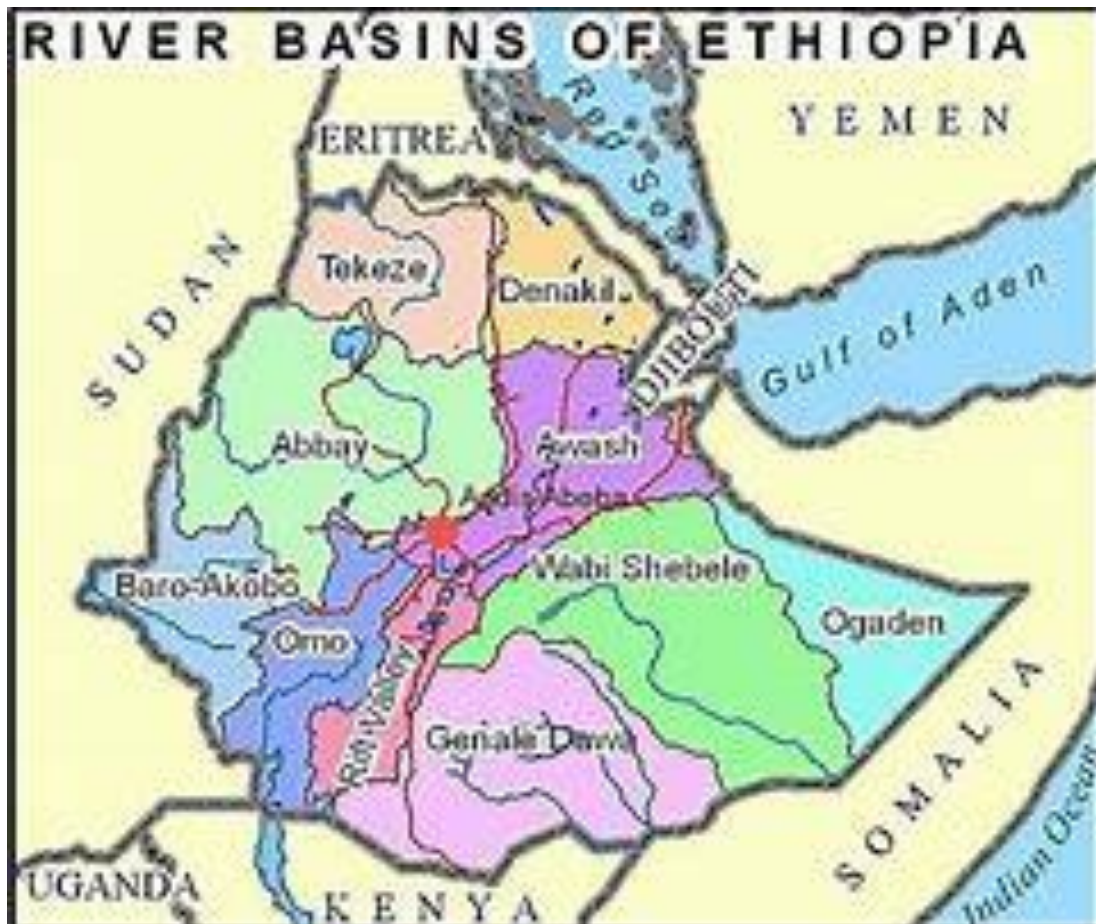
Figure 2. Proposed Basin States [Proposal, page 11]

Accordingly, the new state administrative structure proposed by the two Engineers will constitute of the following administrative states: 1. Abay basin state; 2. Awash, Ayisha and Denakil basins states; 3. Baro-Akobo basin state; 4. Genele-Dawa basin state; 5. Tekeze and Mereb basins states; 6. Wabi-shebele and the Ogaden basins states; 7. Omo-Ghibe basin state; and 8. Rift valley Lakes basin state. [Proposal, page 11] Moreover, I suggest that the two Engineers change all references in their Proposal to a “Basin State” or “Basin States” to “Administrative Region or Regions”. It is important also that we avoid any reference of a separate sovereign entity within the State of Ethiopia.